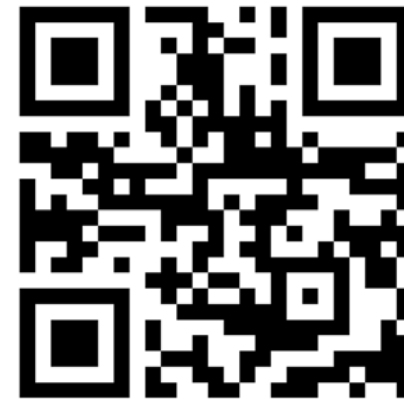
SYSCO/ EUROPEAN IMPORTS TOOL KIT